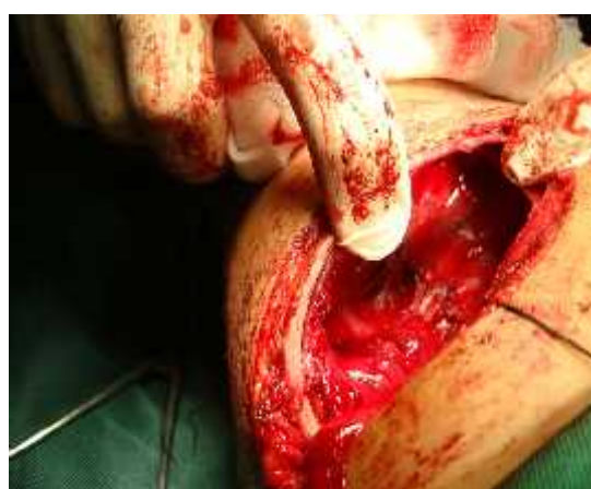
Figure-5: Operative repair Left Thoracotomy