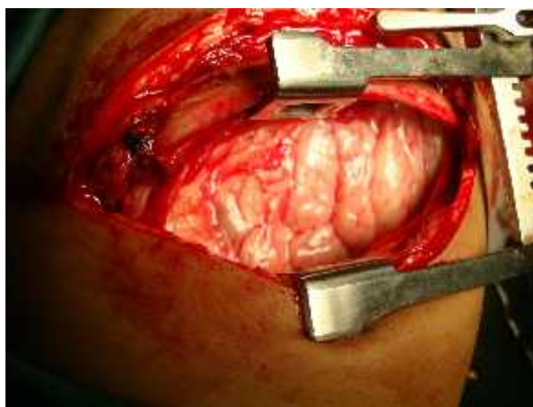
Figure-4: Organs herniated (Affected Organs)