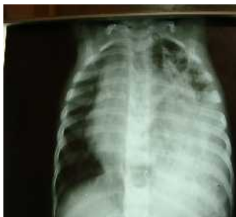
Figure-2: Chest X-Ray (TDR) Left side