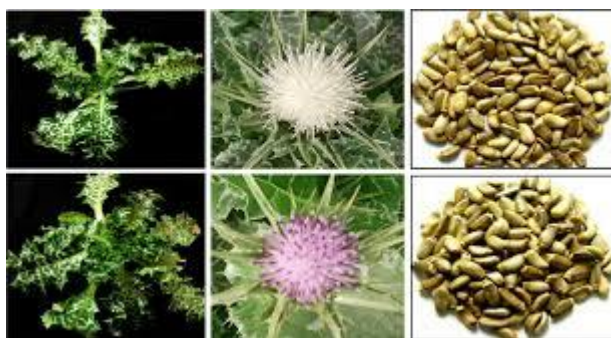
Figur(1):Leaves, seeds of white and purple flowering varieties of Silybum marianum .reaserchgate.com

clearing operators [5]. It has strong anticancer impacts against breast, tumors, ectocervical and prostate [6]. Against the ovarian disease, it improved the viability of doxorubicin and cisplatin in vitro investigation [7]. Silybum marianum has been utilized securely for youngsters, older and pregnant ladies [8-10]. It is utilized in cholestatic, etiologies, viral, heavy drinker and poisonous impact expelling prescriptions [11]. Since the first century milk thistle has been utilized restoratively [12,13], its flower, leaves and roots have been utilized as European eating regimens as vegetable, and its achene is utilized as an espresso. It considered as a spinach substitute. The blossom head is utilized for medication. It is utilized as a cure for Amanita mushroom toxin [14,15].